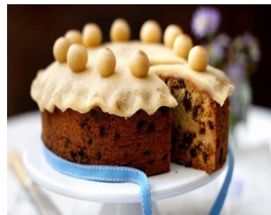
This Photo by Unknown Author is